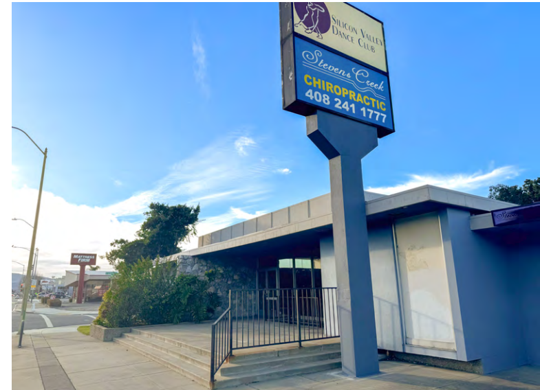
Entrance from Stevens Creek (Street View)