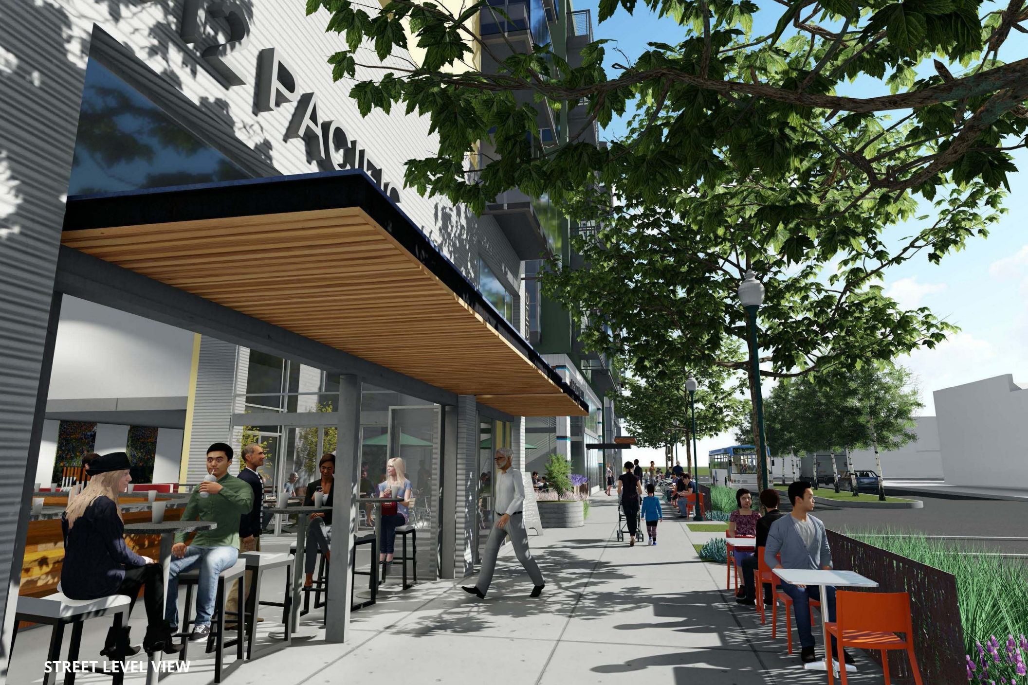
STREET LEVEL VIEW