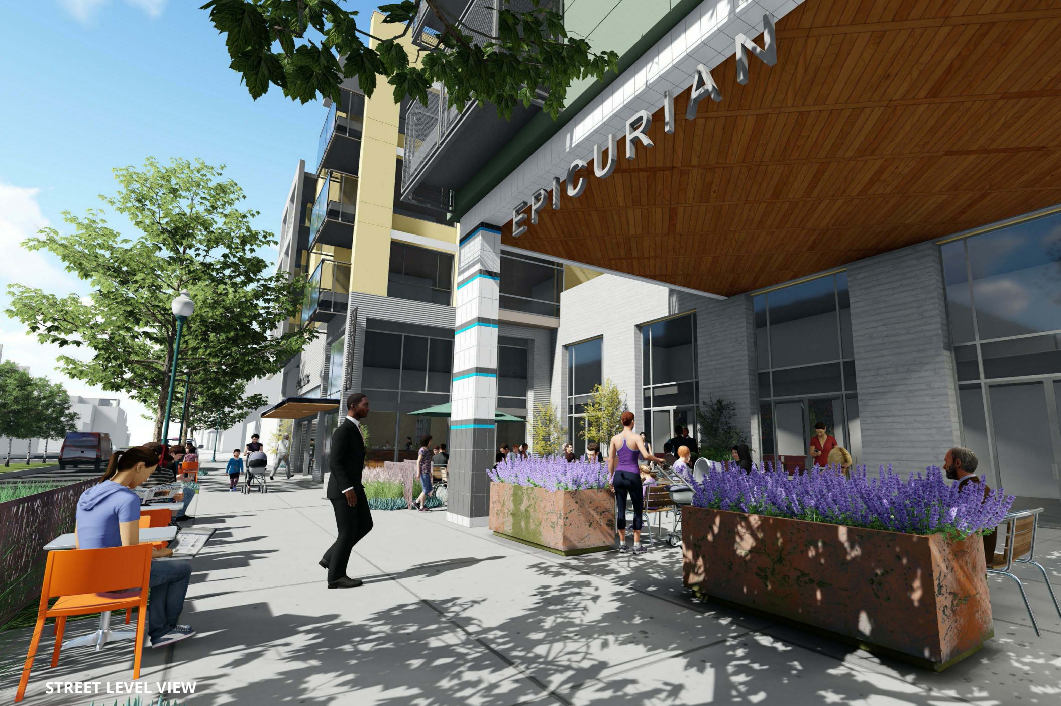
STREET LEVEL VIEW