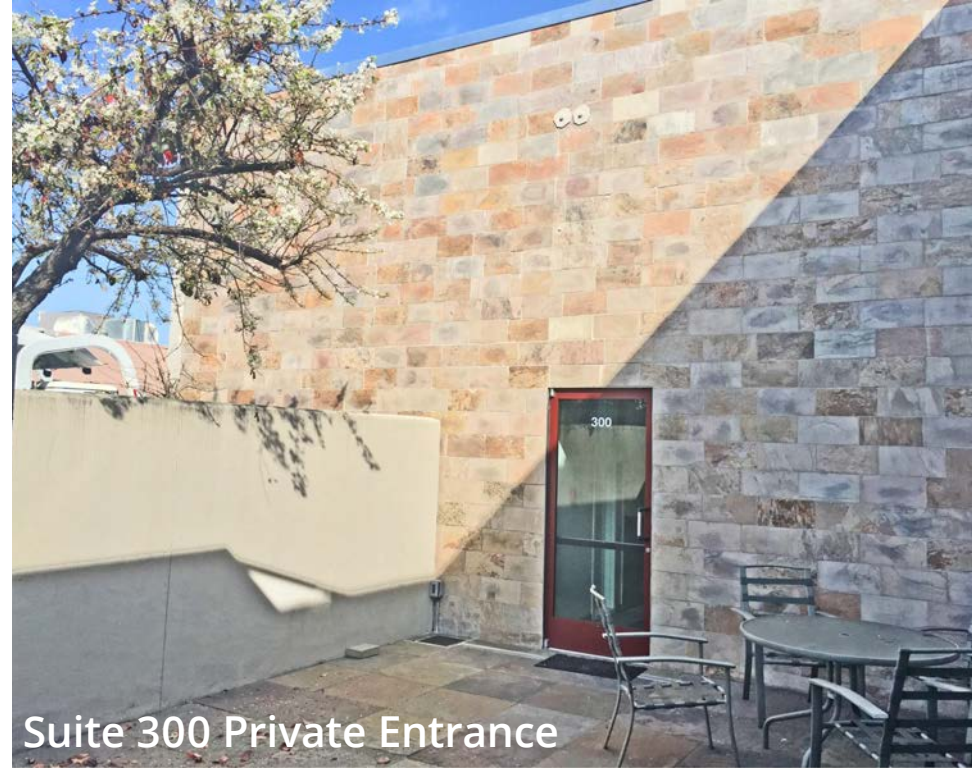
Suite 300 Private Entrance