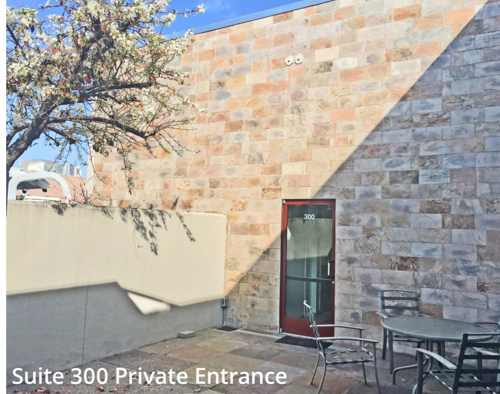
Suite 300 Private Entrance