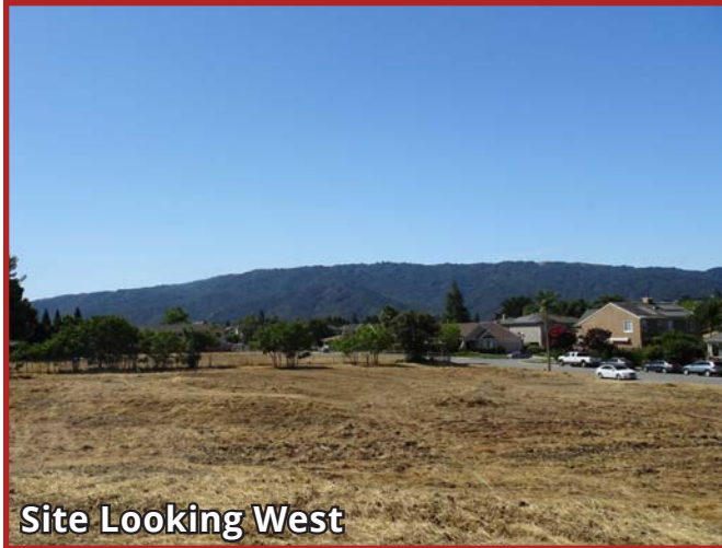
Site Looking West

FOR SALE 9130 and 9160 KERN AVENUE GILROY CALIFORNIA, 95020