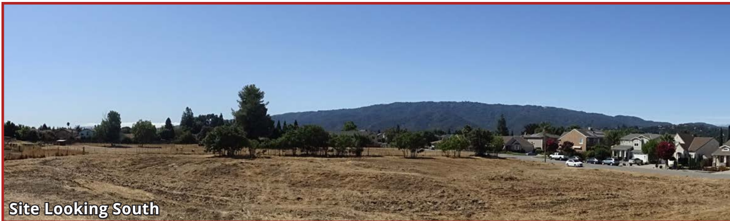
Site Looking South