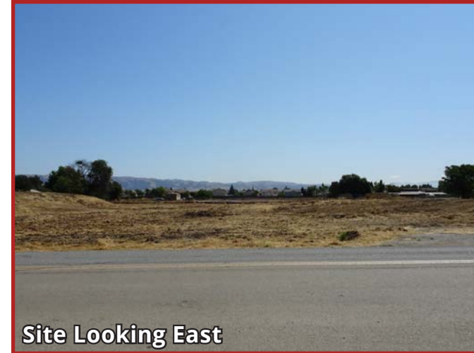
Site Looking East