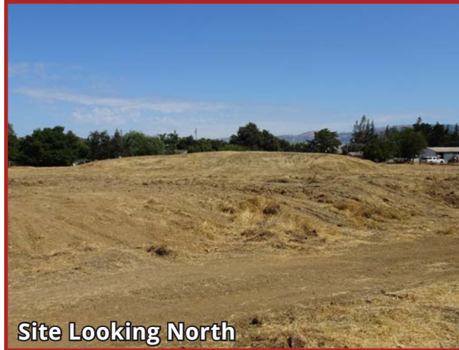
Site Looking North